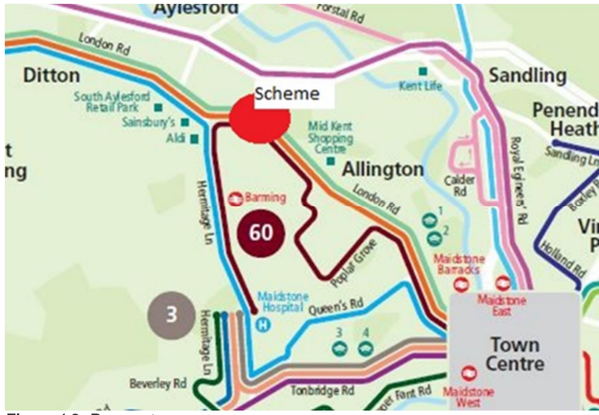
Figure 1.2: Bus routes